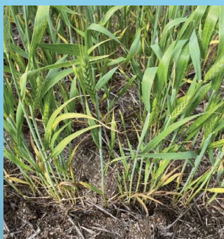
UTC. Photo taken - 14/9/23, 112 DAA. Elongated lesions, clear pycnidia marks on the flag leaf.

The above graph demonstrates STOLI offered the same level of suppression of Yellow Spot, as the comparative product on Wheat cv. Scepter. This replicated trial was conducted at Quairading, WA, during the 2023 cropping season. Liquids applied with a FMSA Friction flow system; liquid treatments placed with the seed. Sowing date – 25th May 2023.