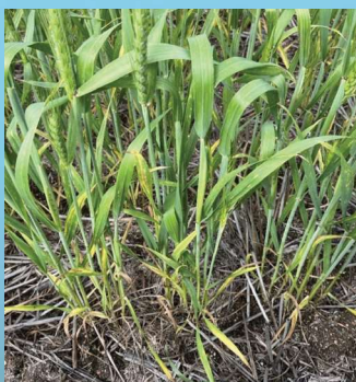
STOLI 400 mL/ha. Photo 14/9/23, 112 DAA. Very few lesions elongated, pycnidia marks on the upper two leaves not easily visible and more green leaf area.